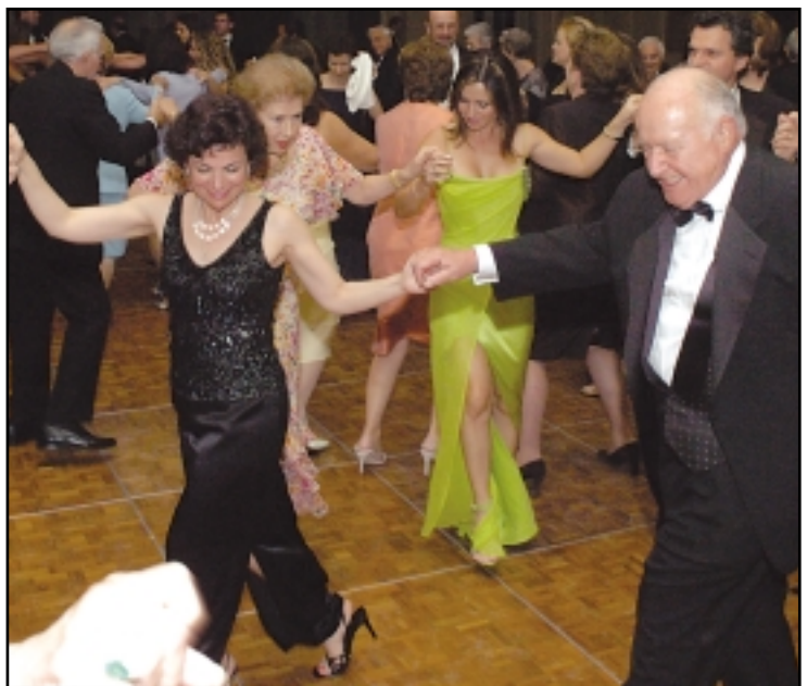
Greek Dancing at Grand Banquet