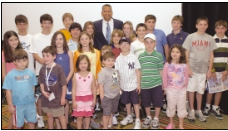
Alex Rodriguez with Leadership 100 youth at Workshop on Sports.

He said that his marriage into one “of the most beautiful families” changed his lifestyle and gave him direction and appreciation of true values by which to live, citing the advice of his wife’s grandfather. His wife reciprocated, calling him one of the most dedicated, loyal and honest partners.