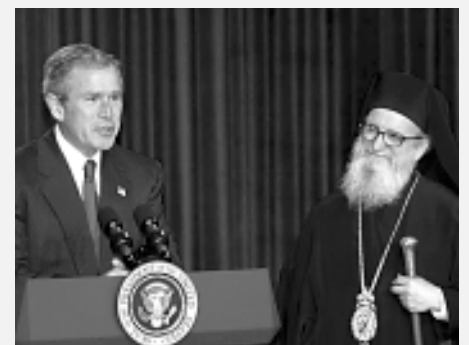
Archbishop Demetrios looks on as President George Bush speaks at the Greek Independence Day Celebration.