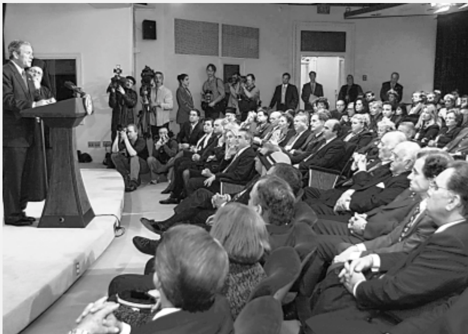
President George Bush addresses Greek Americans, including several Leadership 100 members at Greek Independence Day Celebration at the White House.