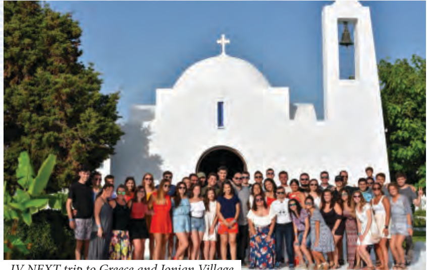
IV NEXT trip to Greece and Ionian Village.

IV Next, a ministry of the Office of Ionian Village supported by a grant from Leadership 100 was inaugurated from May 31 through June 11, 2018. Forty (40) young adults participated in a twelve-day itinerary including time at the Ionian Village campgrounds, as well as excursions to the cornerstones of the Ionian Village travel program. The emphasis of the ministry was on personal and professional development.