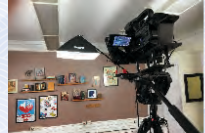
Y<sup>2</sup>AM Studio at the Archdiocese

We reimagined the youth office and created Y^2 A M , a newly invigorated team with a renewed sense of ministry vision and purpose. And we put our new direction to the test as we launched our