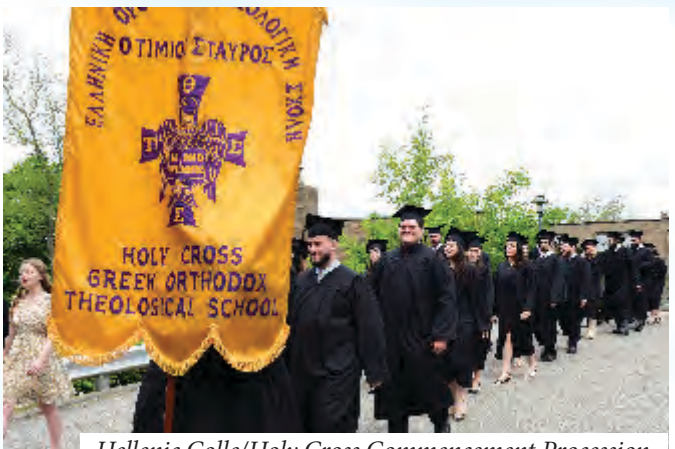
Hellenic Colle/Holy Cross Commencement Procession.

States and struggled through the years. Our family values and strong work ethic were very valuable to me. We had a grocery store in Chicago where I grew up. Growing up we went to church and Sunday school. I was the first of any of my family and relatives to go to college. I lived the American Dream. Looking back, that college experience changed my life, and along with my family values, it gave me the foundation for any success I achieved", he said.